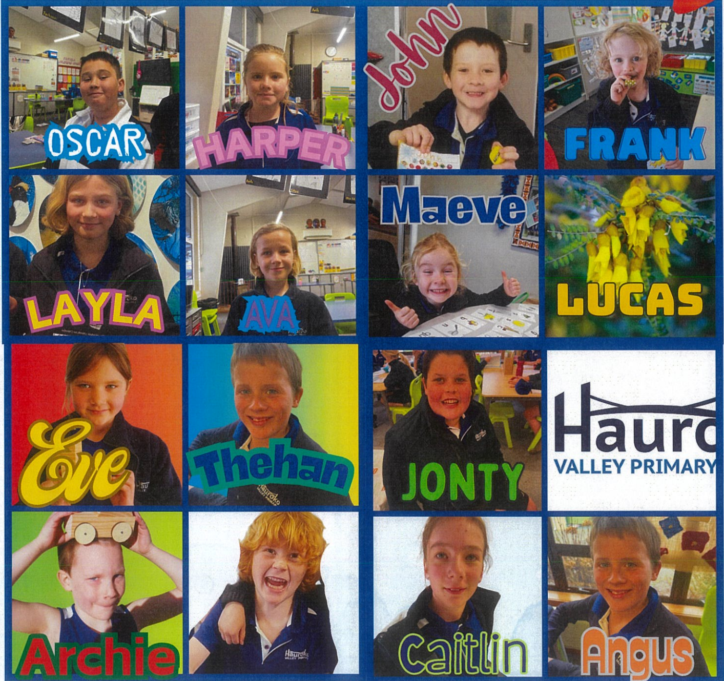
Principal Awards - named as below, not photographed as above.

Congratulations to the following learners for demonstrating a range of skills, knowledge and understanding of HVP School Values, NZ Key Competencies or Literacy, Numeracy, Inquiry, The Arts, Technology, or Health and Physical Education learning. Well done on your progress and achievements!