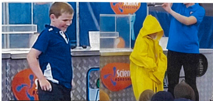
POWER OF SURFACE TENSION

Last week we had our fantastic trip to Invercargill. We had an amazing time at Splash Palace, Queens Park & the Science Roadshow. We learned how electricity flows through a completed circuit and different kinds of conductors and insulators. We learned all about the water cycle and how fresh water is recycled all around the world. There were also many amazing interactive exhibitions to try out.