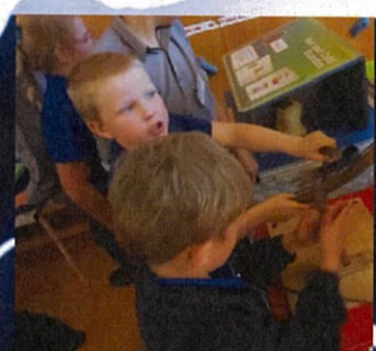
Awesome Interactive Experiences!