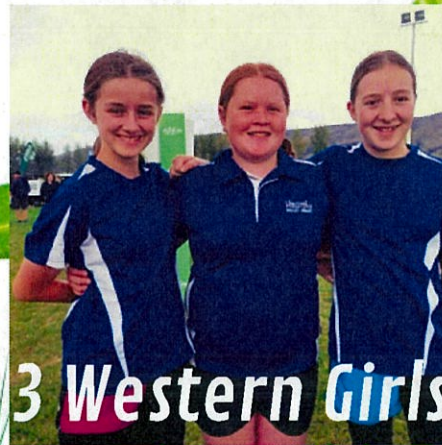
3 Western Girls

The AgriKids runs alongside Teen Ag and Young Farmers. It is really important for learners, to take the theory and apply it to the environment around them, to extend their knowledge further. So, the journey to the 2023 National Young Farmers, Grand Final continues for our Southern Boys and Three Western Girls. Here we come Timaru 6th-8th July.